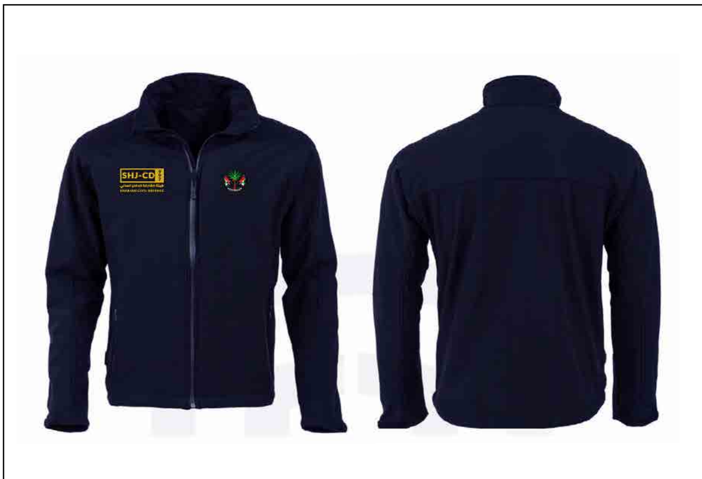
WATERPROOF JACKET SIZE CHART (IN INCHES)