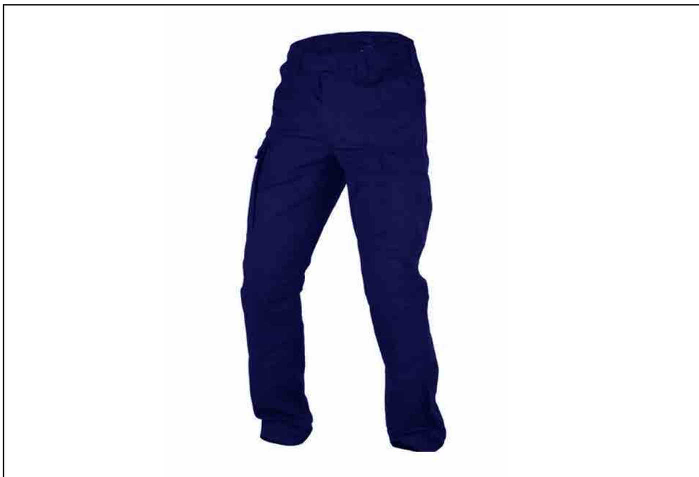
CARGO PANTS SIZE CHART (INCHES)